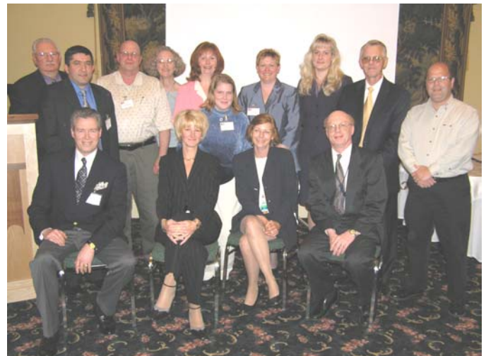
Pictured here are some of the Board Members for the 2005-2006 Chapter Year.