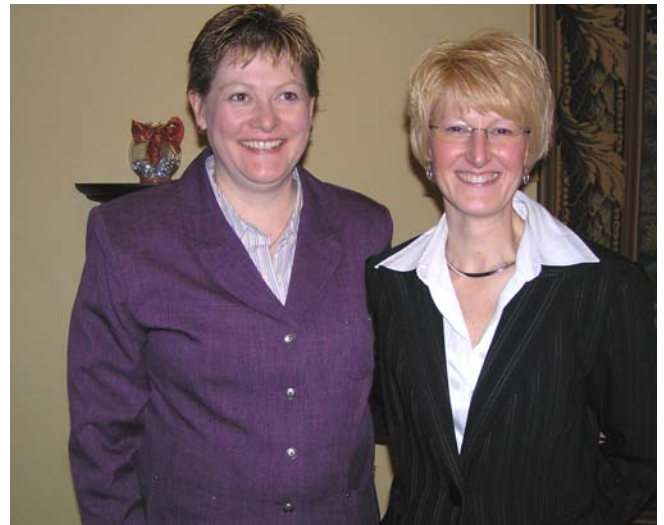
Shown on the left is the President for the 2005-2006 chapter year with the President for the 2004-2005 chapter year.